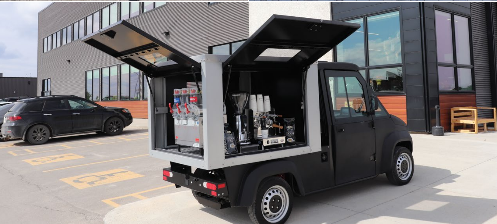
MULTIPLE VAN BODY CONFIGURATIONS AVAILABLE