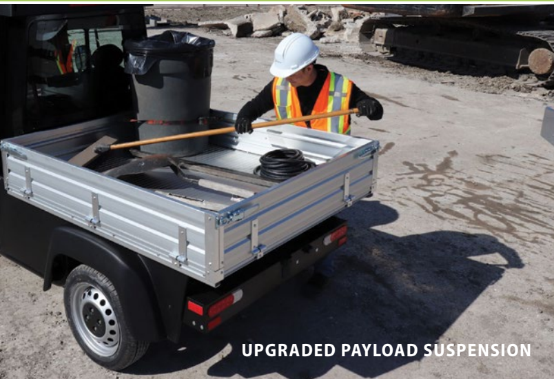
UPGRADED PAYLOAD SUSPENSION