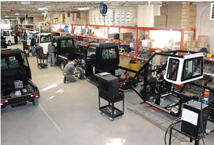
BUILDING LITHIUM ION EVS SINCE 2014

**Total Payload includes allocation for operators. MAX 15-20 have reduced payloads due to max GVWR LSV class of 3000lbs. Payloads are based on a base vehicle, no options.