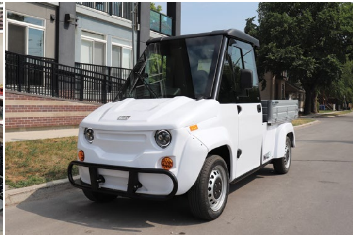
WHITE MAX-EV WITH NERF BAR & CLAMPING WALLS

BORTEK INDUSTRIES, INC. LOCAL: 717.737.7162 TOLL FREE: 800.626.7835 contact@sweeperland.com