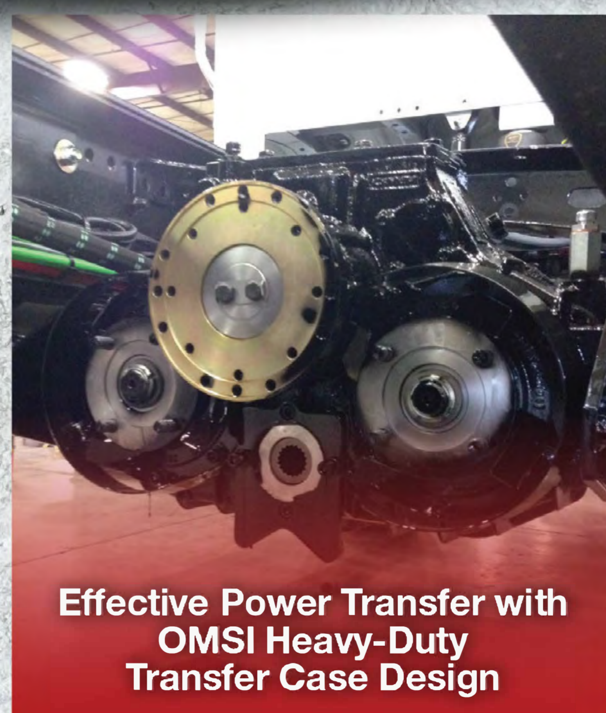
Effective Power Transfer with OMSI Heavy-Duty Transfer Case Design