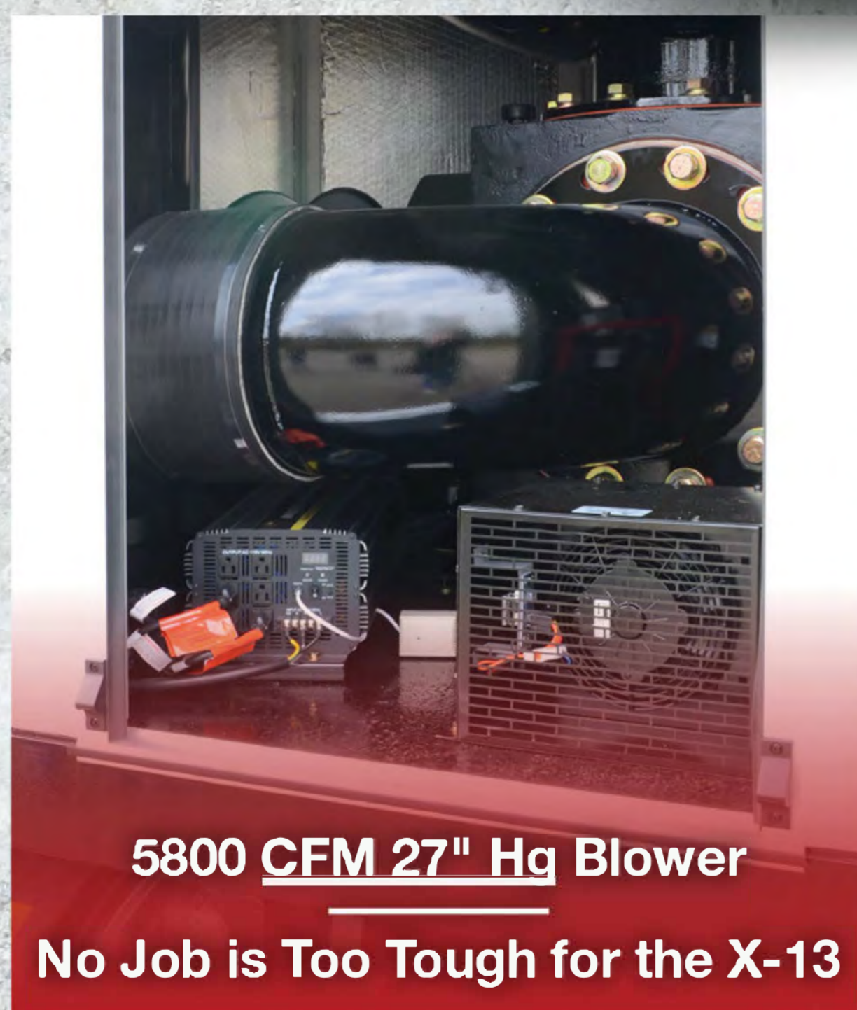
5800 CFM 27" Hg Blower No Job is Too Tough for the X-13