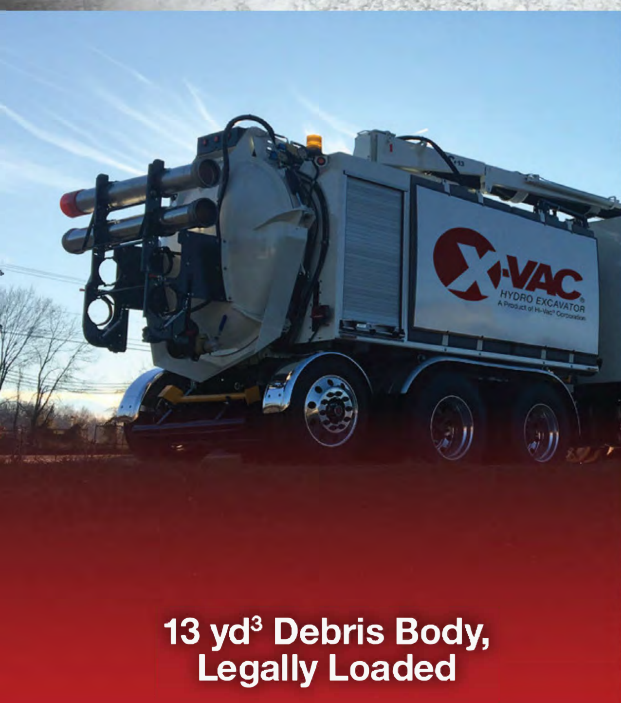
13 yd 3 Debris Body, Legally Loaded