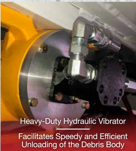
Heavy-Duty Hydraulic Vibrator Facilitates Speedy and Efficient Unloading of the Debris Body