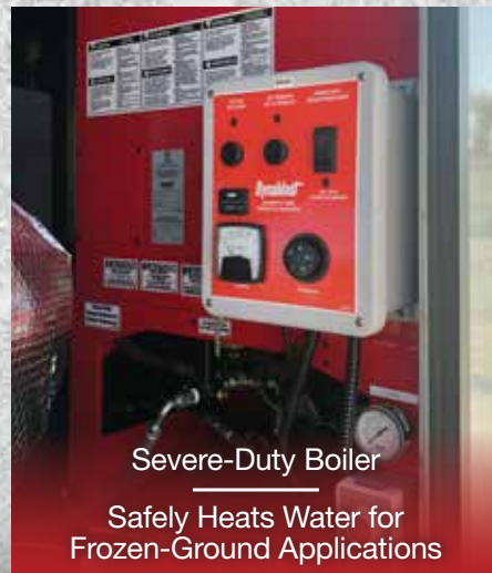
Severe-Duty Boiler Safely Heats Water for Frozen-Ground Applications