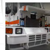
ABOVE The Global M4 features many maintenance-friendly attributes, such as a rear swing-out radiator, easy access front mounted AC condenser, brake and windshield washer fluid reservoirs, and cab fresh air filter.