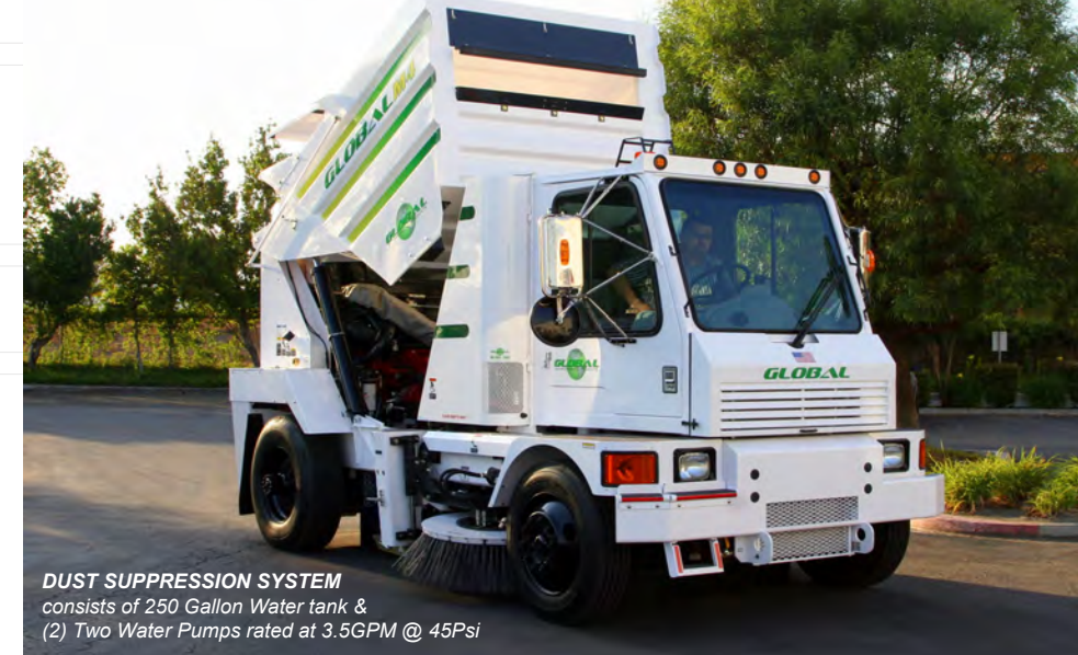
DUST SUPPRESSION SYSTEM consists of 250 Gallon Water tank & (2) Two Water Pumps rated at 3.5GPM @ 45Psi

ABOVE The Global M4 is designed to make routine maintenance easy, so your sweeper spends more time on the street and less time in the garage. Two swing-out center body panels provide unrestricted access to elevator adjustment, maintenance and daily cleaning.