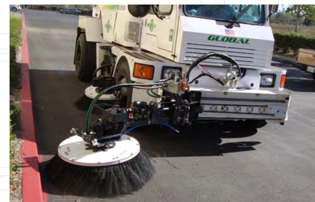
LEFT The Global M4 offers the best maneuverability in its class with its tight turning radius that allows the operator to maneuver easily in cul-de-sacs and close quarters.

Optional Front Articulating brush allows for extra reach to shoulders and center islands. Via In-cab joystic, the articulating front brush can be positioned on left or right side allowing for sweeping on right or left without changing seating positions.