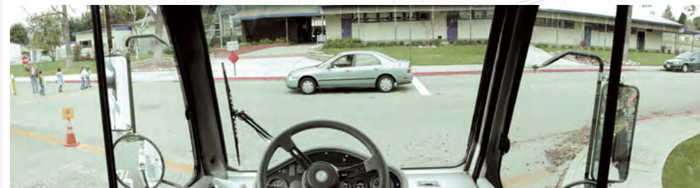
ABOVE Exceptional visibility increases operator and pedestrian safety.