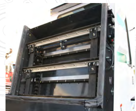
BELOW Elevator Type: optional 11 Flight squeegee with replaceable corded rubber tips; Continuous molded rubber belts combine with optional triple pump option (below) to make Global M4 the logical choice for sweeping heavy debris such as road millings, sand and gravel up to 3-tons per-minute. That is one ton of sand every 20 seconds! Standard leaf gate system assists in picking up large debris, bottles, large branches and leaves.

Optional Front Articulating brush allows for extra reach to shoulders and center islands. Via In-cab joystic, the articulating front brush can be positioned on left or right side allowing for sweeping on right or left without changing seating positions.