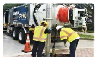
SEWER & PIPELINE JET/VAC TRUCKS