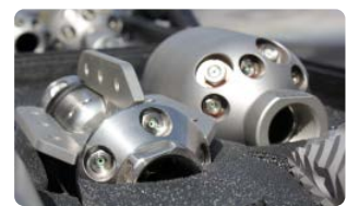
JETTING & SEWER NOZZLES