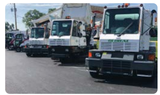
EQUIPMENT RENTALS SHORT & LONG TERM