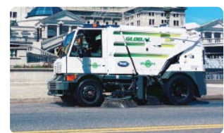
STREET & PARKING LOT SWEEPERS