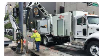
AIR & HYDRO EXCAVATORS

We specialize in providing cleaning solutions. Being experts in our field allows us to customize your cleaning package based on your specific needs.