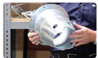
JETTING & VACUUM TOOLS