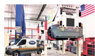
EQUIPMENT SERVICE & MAINTENANCE