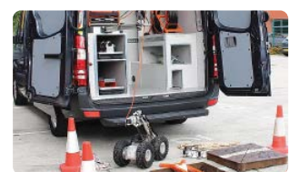
SEWER & PIPELINE INSPECTION SYSTEMS